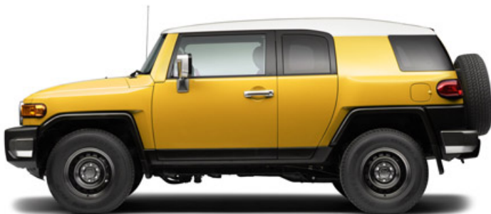
4x4 5-Speed Auto (4704) MSRP* Starting At: $23,300.00